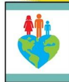
Paws for Action - Duty to Country