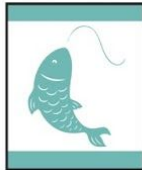
A Bear Goes Fishing