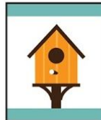
Fur, Feathers, & Ferns