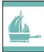
Bear Picnic Basket