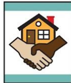
Fellowship & Duty to God