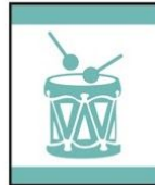
Beat of the Drum