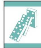
Make it Move