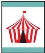
Grin & Bear It