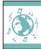
A World of Sound