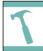
Baloo the Builder